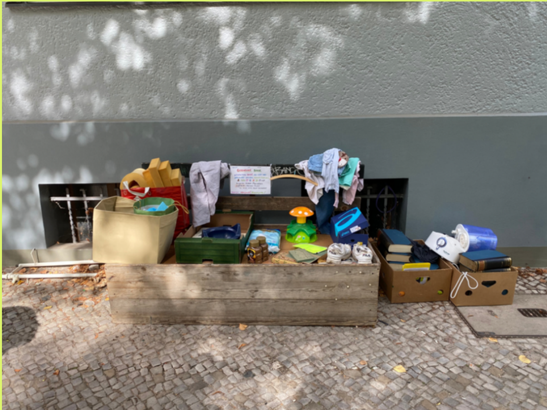
THIS IS A GIFT BANK ON A STREET IN ONE OF BERLIN'S NEIGHBOURHOODS.